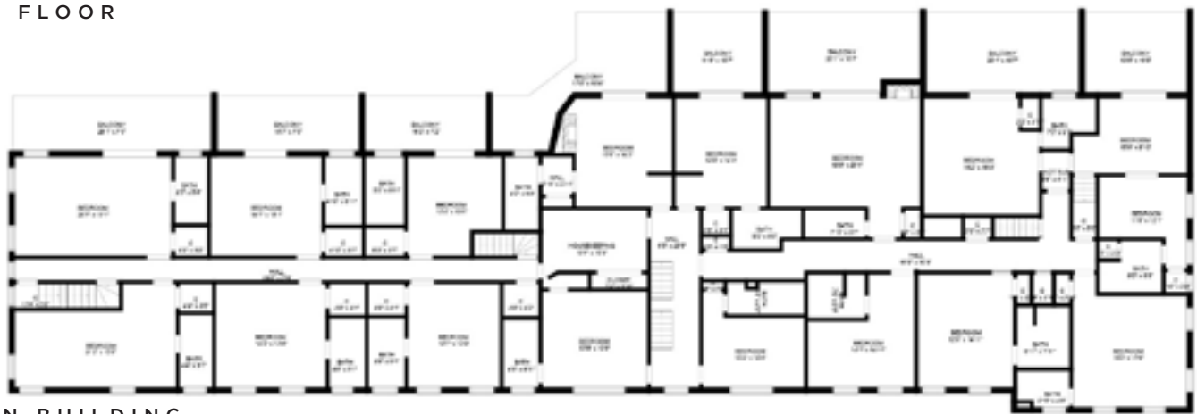
MAIN BUILDING 2ND FLOOR