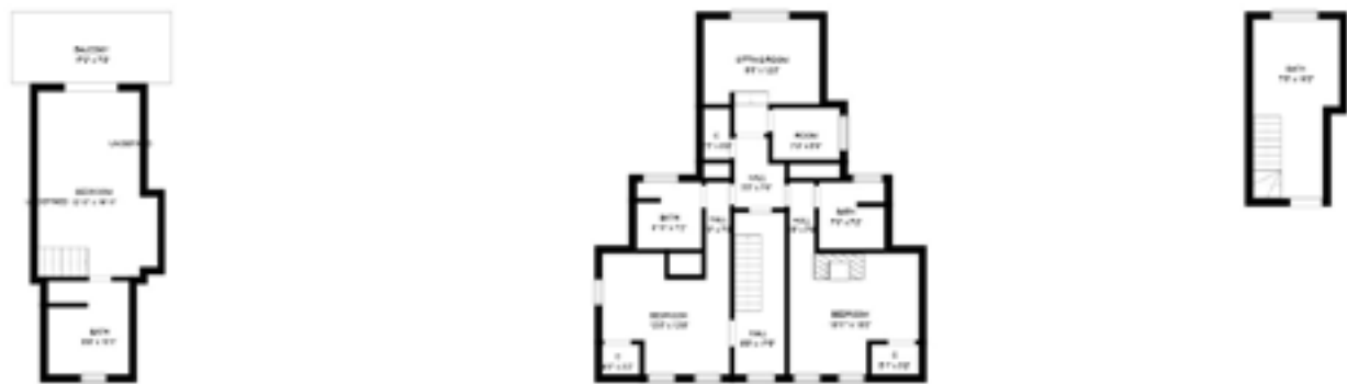
MAIN BUILDING 3RD FLOOR