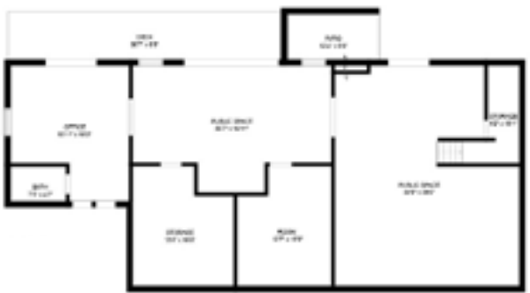
MAIN BUILDING GROUND FLOOR